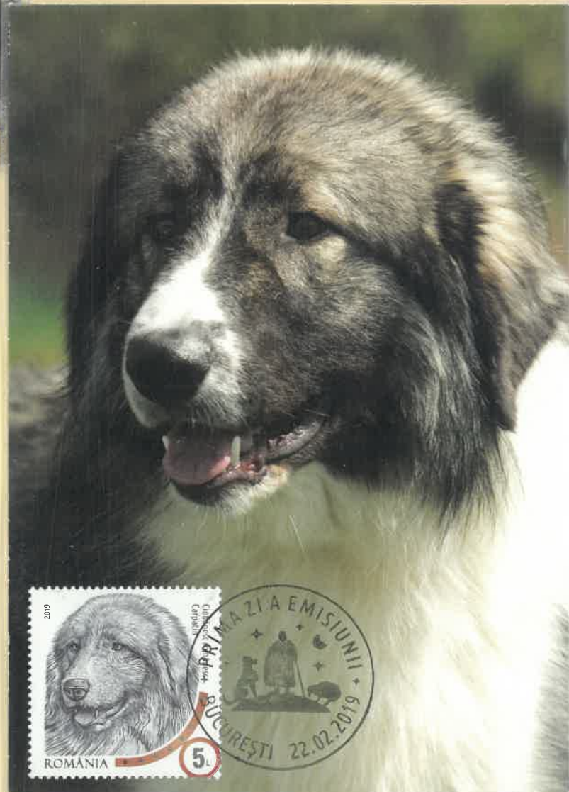
Date of issue: 22.2..2019 ♦ Postcard from Romania, F.D.I. cancellation: Bucuresti 22.02.2019