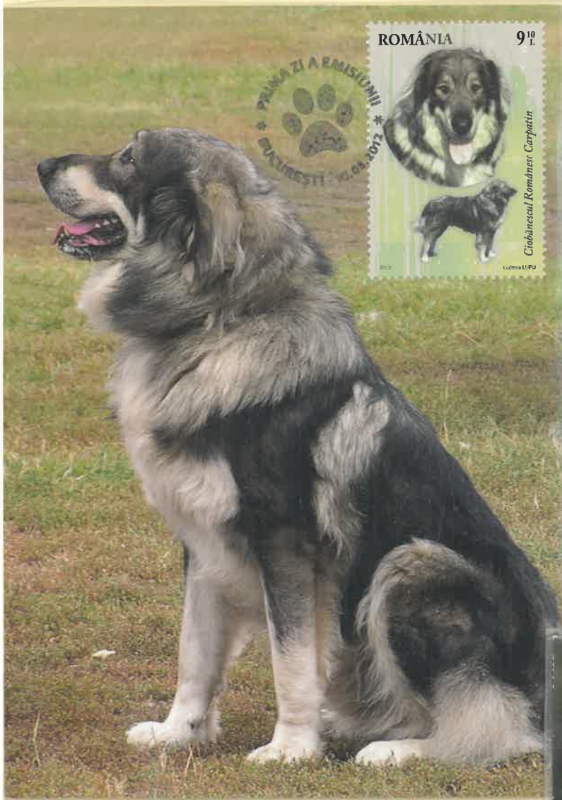
Date of issue: 10.8.2012 ♦ Postcard from Romania, F.D.I.cancellation: Bucuresti – 10.08.2012