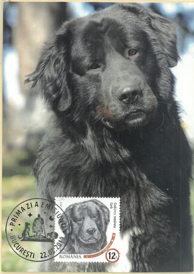
Date of issue: 22.02.2019 ♦ Postcard Romania F.D.I.cancellation: Bucuresti 22.02.2019